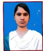
ANNU COSMETOLOGY TOTAL MARKS : 535/600